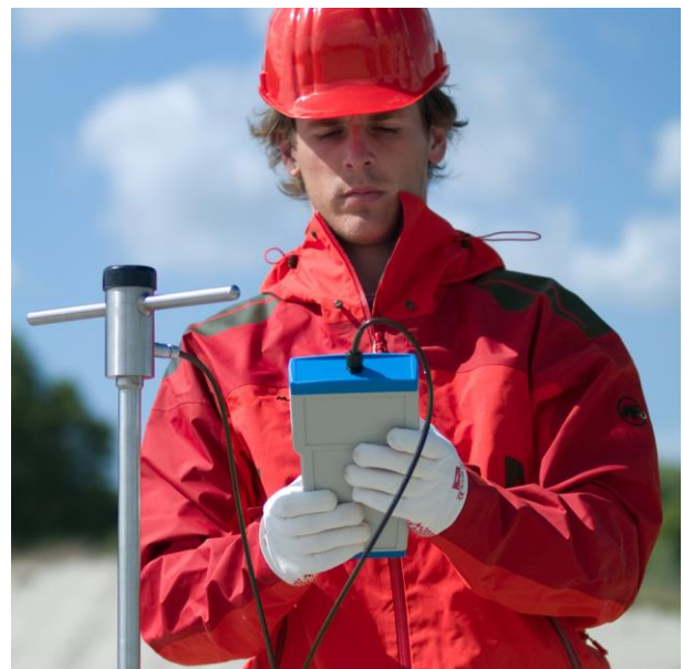
Figure 2 FTN02 being used in an on-site (field) survey

FTN02 is a thermal needle measuring system for on-site measurements of thermal conductivity (or the inverse value, resistivity) at depths from the surface down to a depth of 1.5 metre. Due to its robustness and length, FTN02 is the best solution for route-surveying of high-voltage electric power cables and heated pipelines (typical depth of burial of 1.5 m). The measurement method is based on the use of a "thermal needle". This method employs a heating wire and a temperature sensor in a needle. The FTN02 system consists of the thermal needle, model TP09, mounted on a long lance, LN02, and a control and readout unit CRU02. FTN02 is easy to use. After making a small-diameter access hole, the thermal needle TP09 is brought down to just above the point that must be investigated and then pushed into the local undisturbed soil below. The user performs control and readout of the measurement from the handheld CRU02.