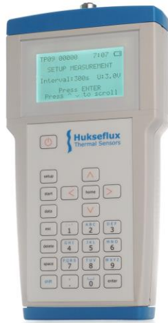
Figure 4 FTN02: CRU02 control and read out unit