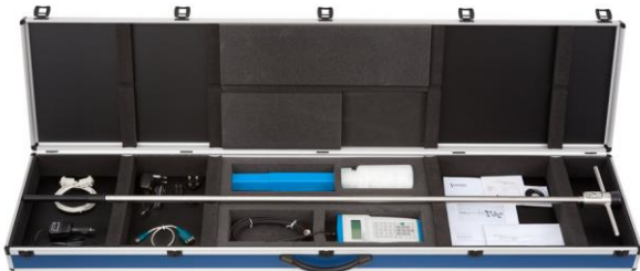
Figure 5 The complete FTN02 system: FTN02 includes one spare sensor TP09, adapters for charging the system in the office, WSA02, and in an automobile, CA02. Also included are communication software and a jar for glycerol. Glycerol must be purchased locally.